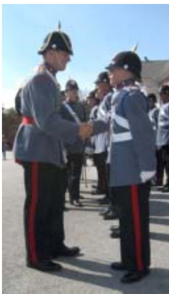
Recognition Weekend, 2002