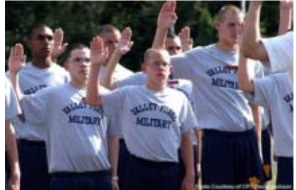
Above- Plebes take the Cadet Oath on their first day before saying goodbye to all they know for six weeks.