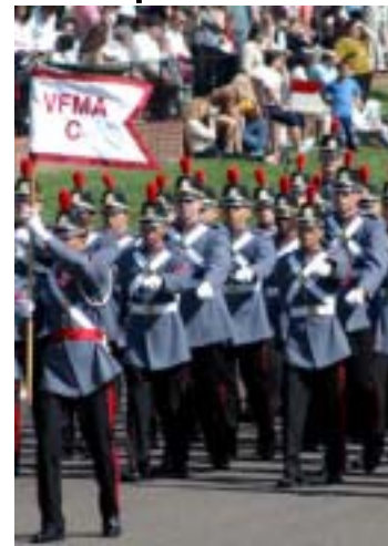
C Company takes part in Recognition Parade